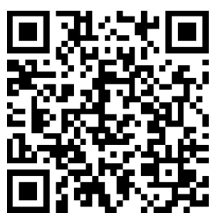
A3 Black & White